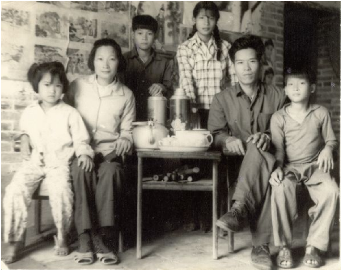
My first family picture taken in 1983. I'm the boy standing in the back.