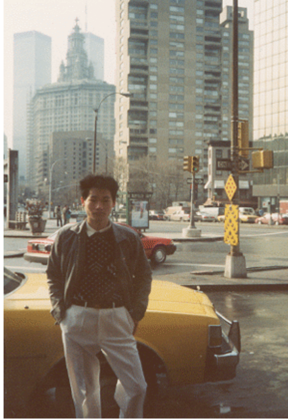
New York City. I spoke no English when I came to America.