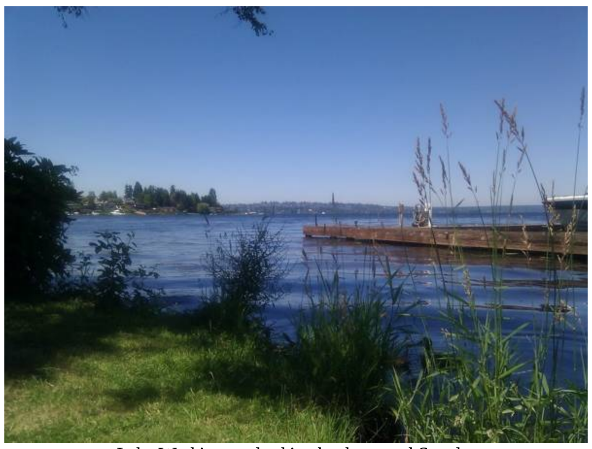
Lake Washington, looking back toward Seattle.