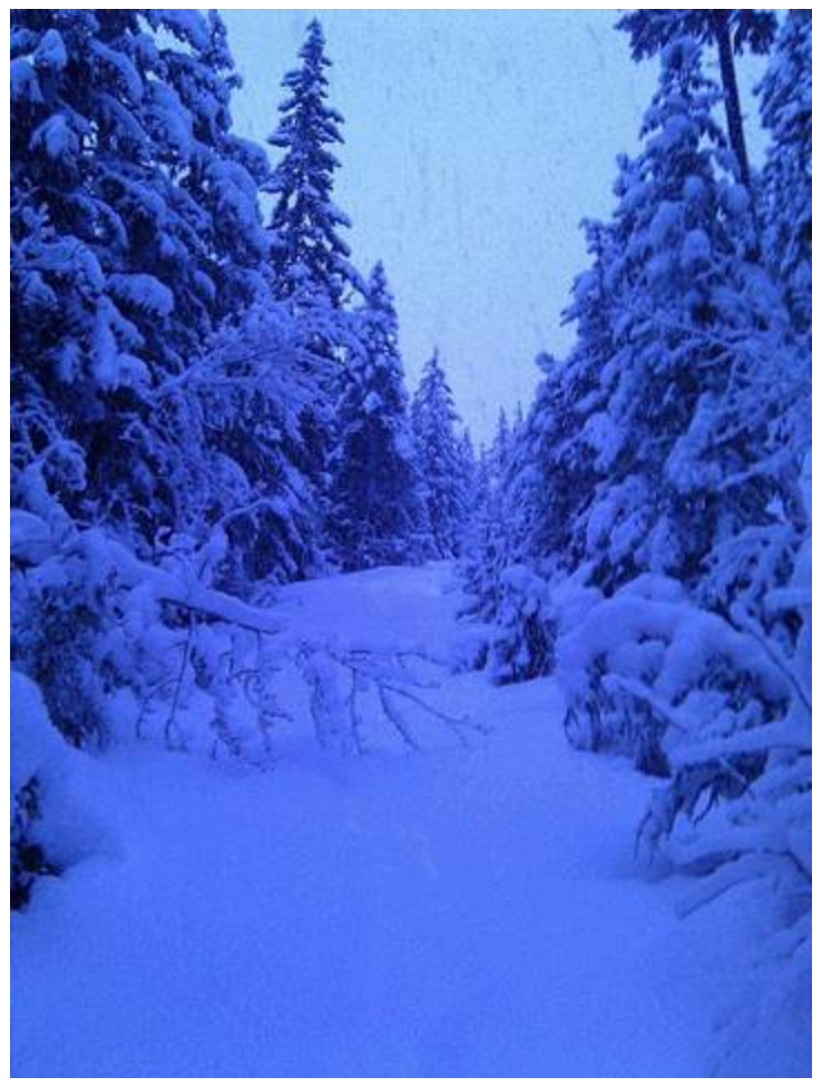
Snowshoeing in Whistler, BC.

Proceeding when there are obvious issues is a dumb thing to do. Even if it's inconvenient or painful, I've learned, I'm better off doing nothing when the only available choice has glaring issues.