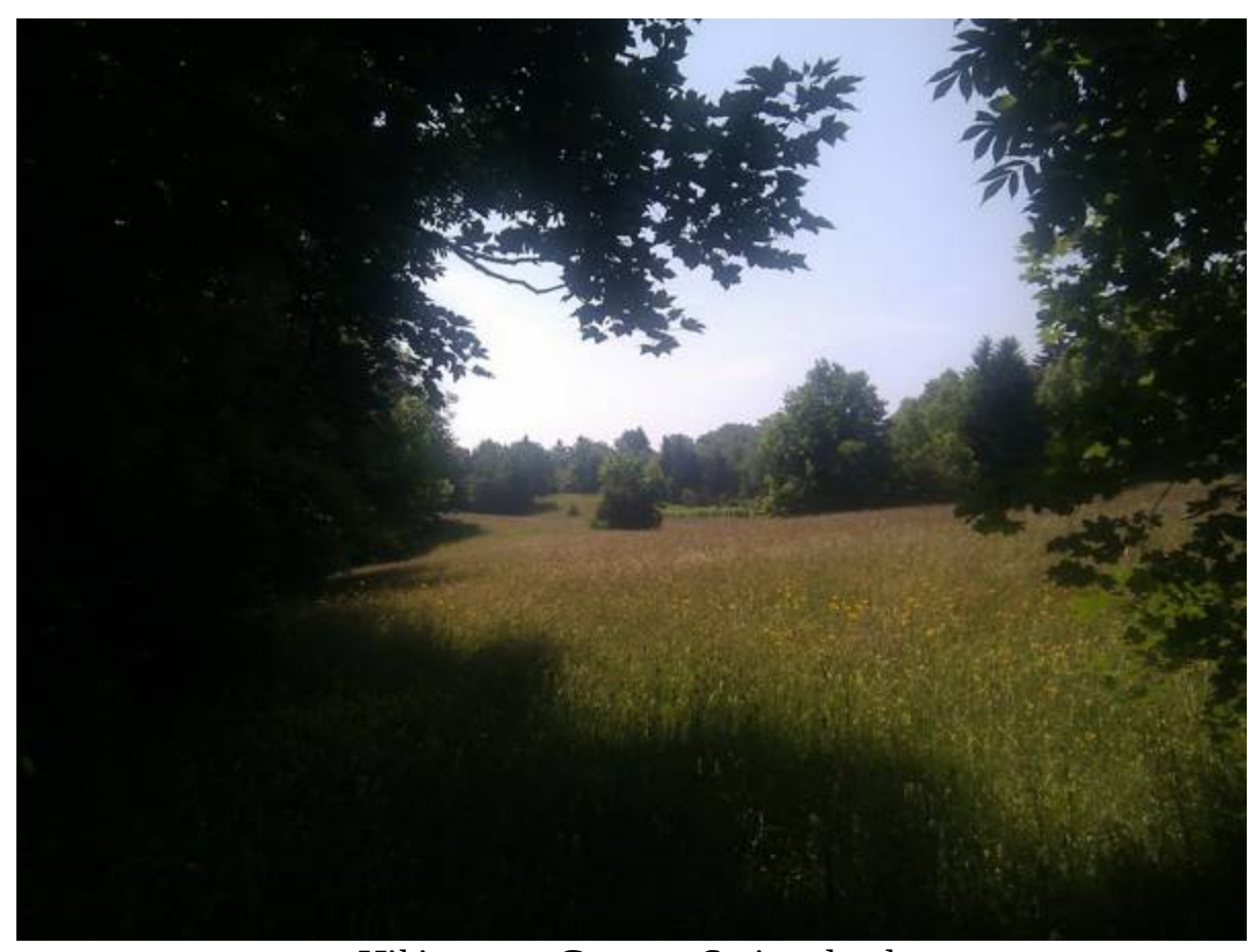
Hiking near Geneva, Switzerland.