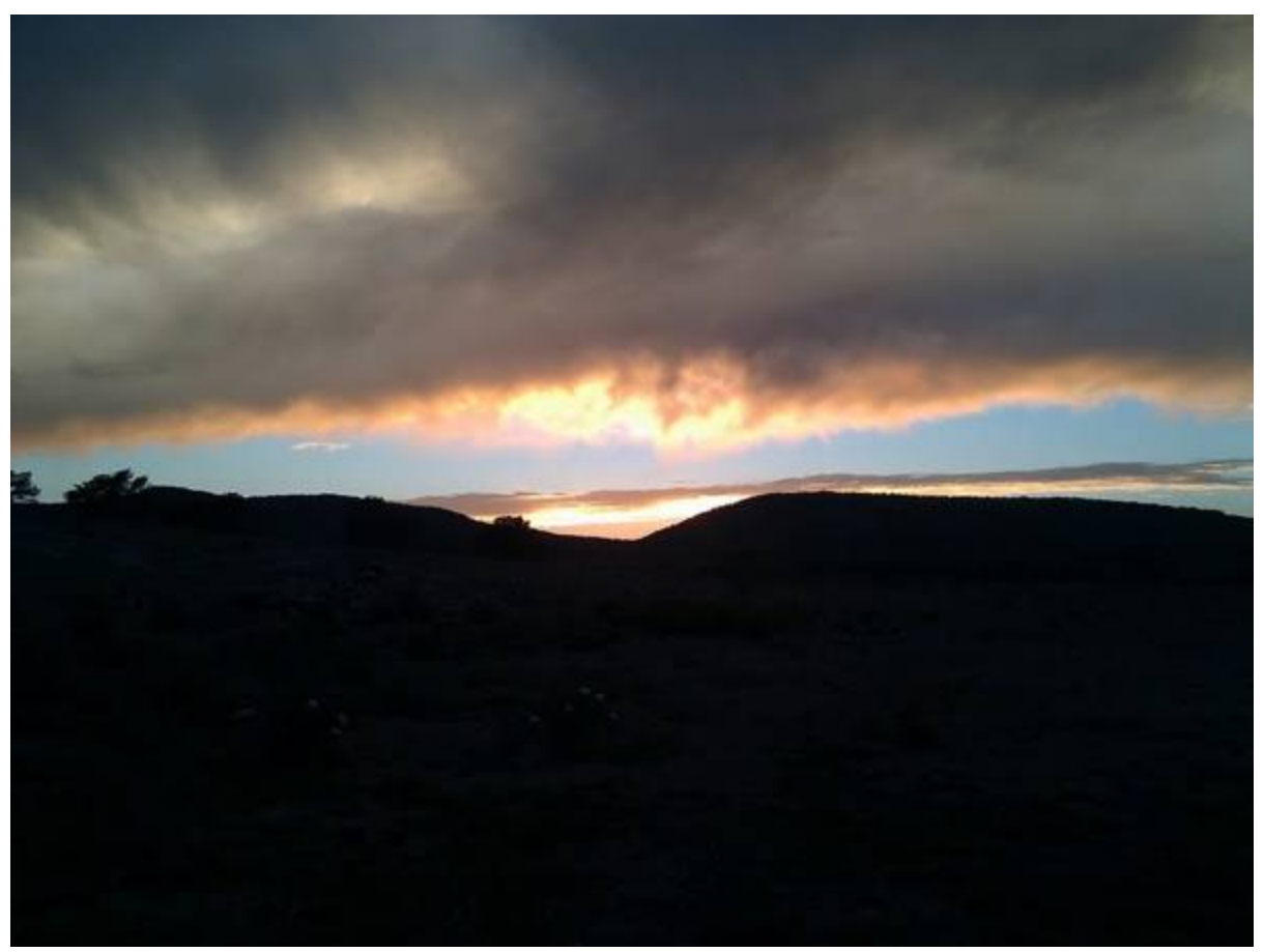
Sunset at the edge of the Glass Mountain Range, West Texas.