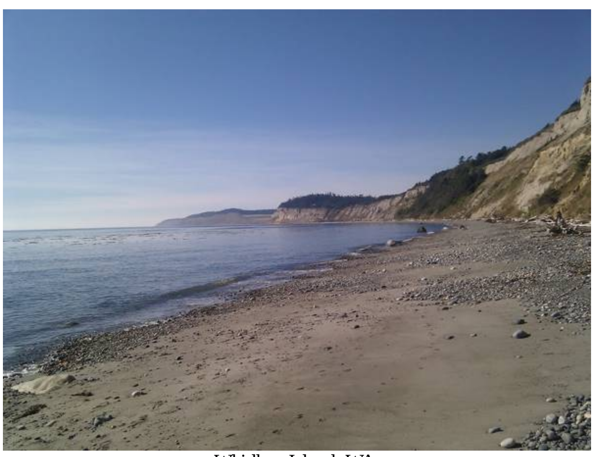
Whidbey Island, WA.