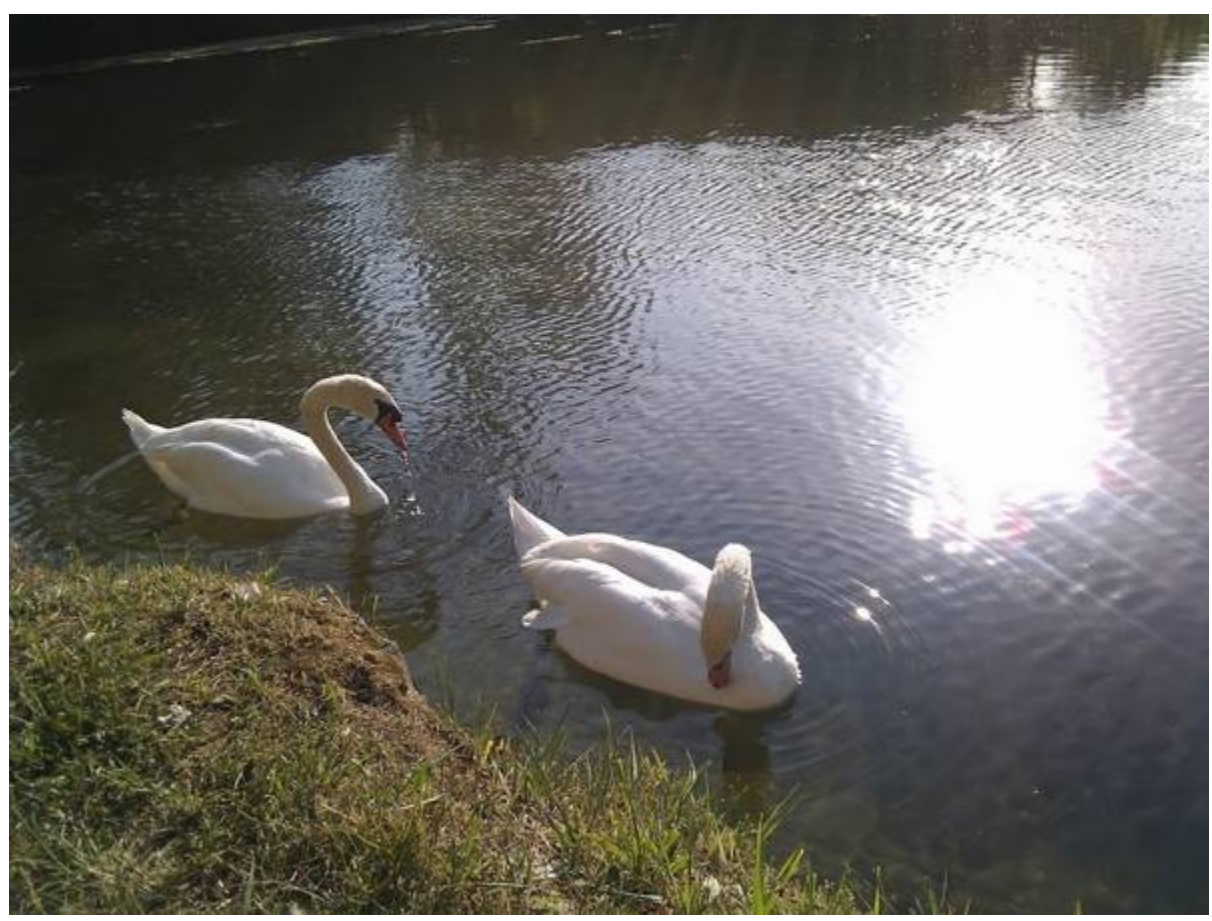
Bois de Boulogne, Paris.

When you're in your 80s, and looking back on your life, I have little doubt you'll feel better if you have chosen to give something back. Our time on earth is limited, but you can extend your influence by helping those who will outlive you.