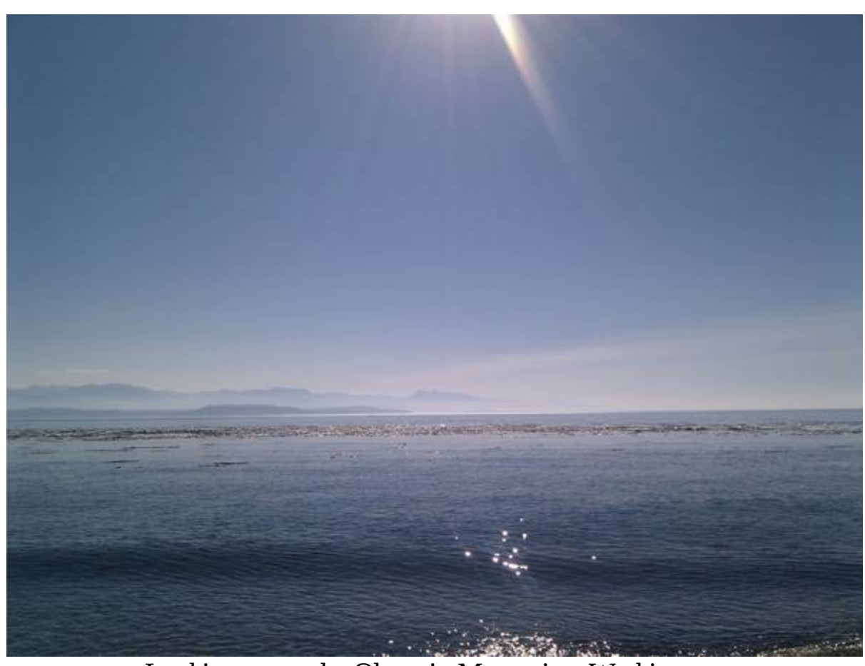
Looking out to the Olympic Mountains, Washington.