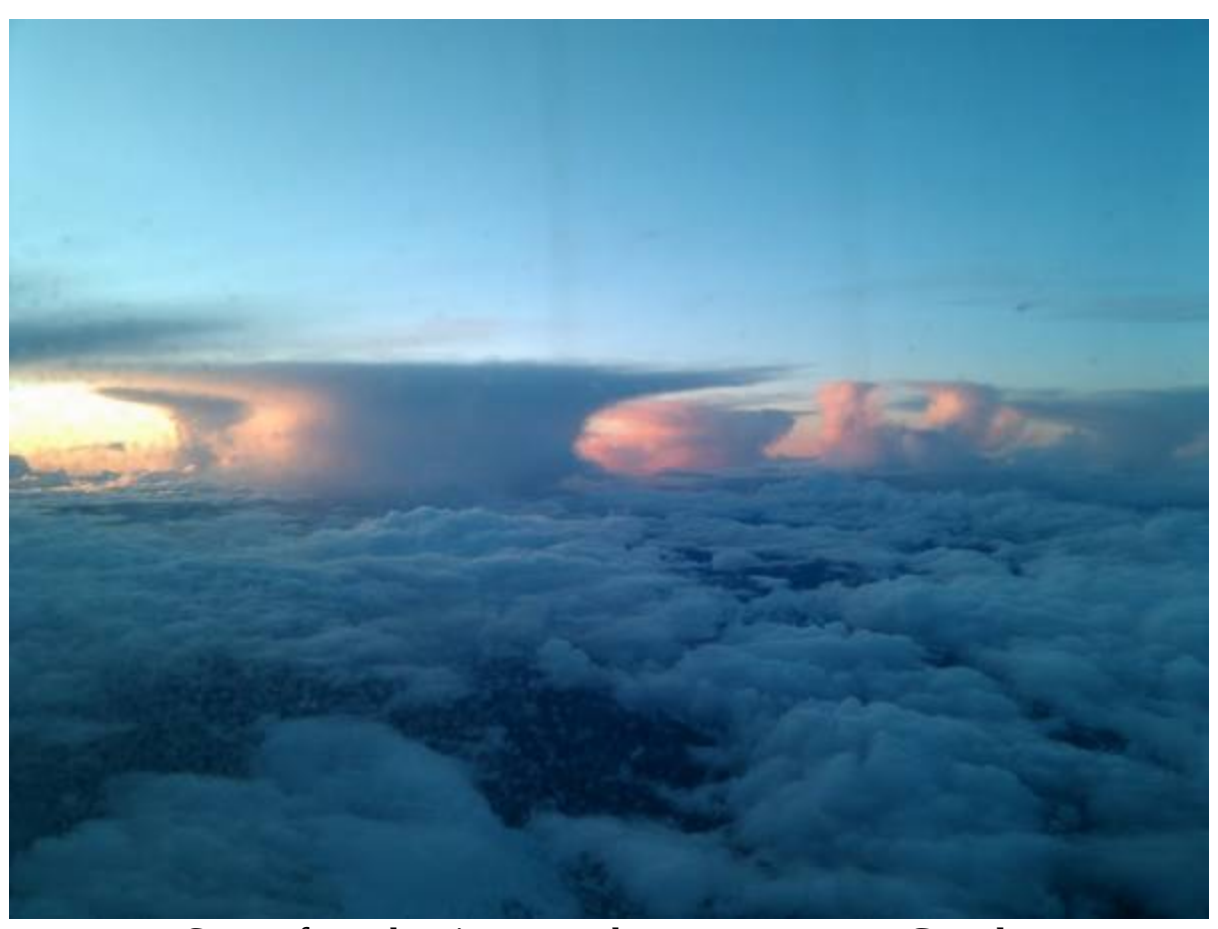
Sunset from the air; somewhere over western Canada.