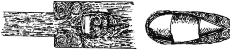
Fig. 1.5 Sketches from Leonardo da Vinci's notes (No. 2)

On the other hand, the advent of hydrodynamics, which tackles fluid movement both mathematically and theoretically, was considerably later than that of hydraulics. Its foundations were laid in the eighteenth century. Complete theoretical equations for the flow of non-viscous (non-frictional) fluid were derived by Euler (see page 59) and other researchers. Thereby, various flows were mathematically describable. Nevertheless, the computation according to these theories of the force acting on a body or the state of flow resulted in a very different outcome from the experimentally observed result.