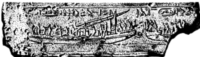
Fig. 1.2 Relief of ancient Egyptian ship

As stated above, the history of the city water system is very old. But in the development process of city water systems, in order to transport water effectively, the shape and size of the water conduit had to be designed and its