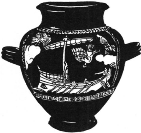
Fig. 1.3 Ancient Greek ship depicted on old vase

inclination or supply pressure had to be adjusted to overcome friction with the wall of the conduit. This gave rise to much invention and progress in overcoming hydraulic problems.