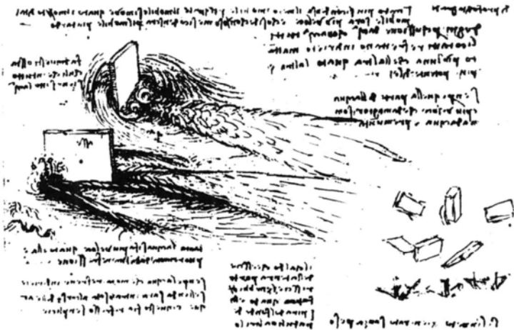
Fig. 1.4 Sketches from Leonardo da Vinci's notes (No. 1)

In addition, he made many discoveries and observations in the field of hydraulics. He forecast laws such as the drag and movement of a jet or falling water which only later scholars were to discover. Furthermore he advocated the observation of internal flow by floating particles in water, i.e. ‘visualisation of the flow’. Indeed, Leonardo was a great pioneer who opened up the field of hydraulics. Excellent researchers followed in his footsteps, and hydraulics progressed greatly from the seventeenth to the twentieth century.